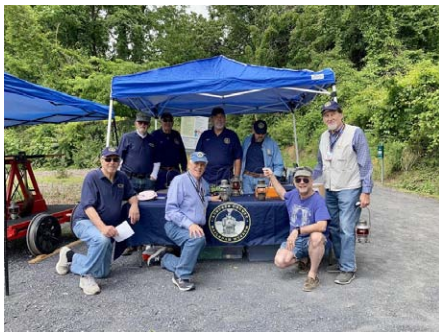
Museum volunteers display items at the East Parking lot, Afton Va.

The Augusta County Railroad Museum is pleased to be the invited guests of the Blue Ridge Tunnel Foundation at the East Parking Lot of the Blue Ridge Tunnel in Afton, Va, Thursday October 12, 2023.