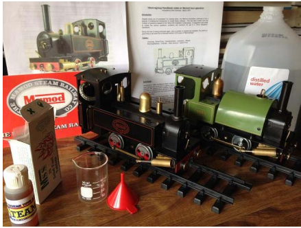
Models of live steam locomotives.

In keeping with the museum's mission of promoting an interest in railroading and model railroading, we are selecting a hand full of 'portable' exhibits which can be easily demonstrated and explained.